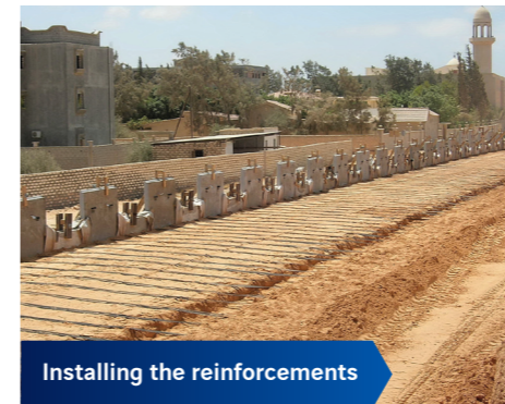
Installing the reinforcements