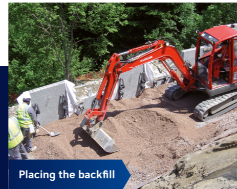
Placing the backfill