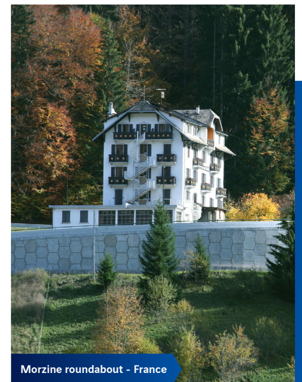
Morzine roundabout - France