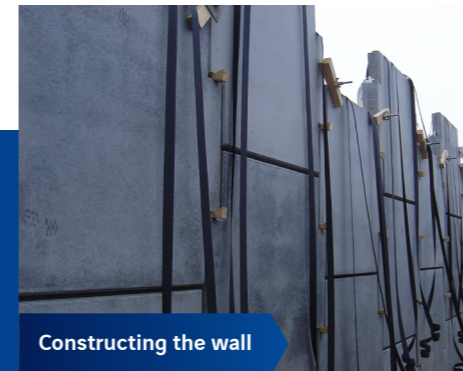
Constructing the wall