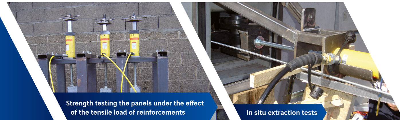
Strength testing the panels under the effect of the tensile load of reinforcements

Geoquest is fully committed to research into the sustainability of its solutions. The structural design incorporates the most up-to-date knowledge available on durability of the materials employed.