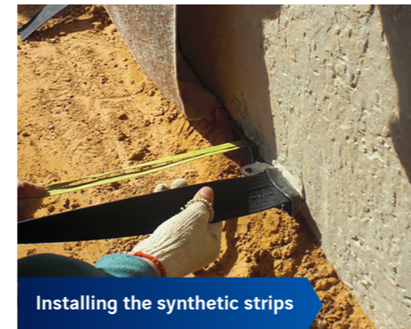
Installing the synthetic strips