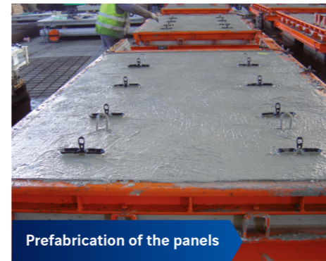
Prefabrication of the panels