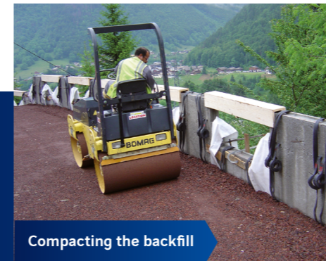
Compacting the backfill