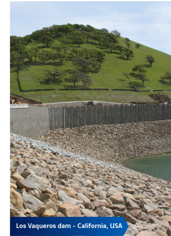
Los Vaqueros dam - California, USA

As the world leader in mechanically stabilized earth , Geoquest has a presence in five continents, and benefits from both local and international expertise.