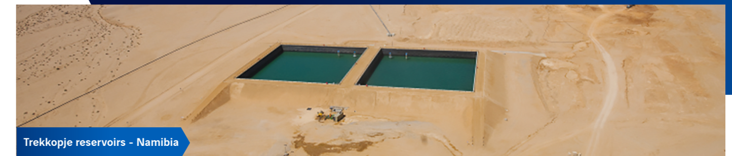
Trekkopje reservoirs - Namibia

This wealth of expertise has led Geoquest to develop processes offering common advantages: