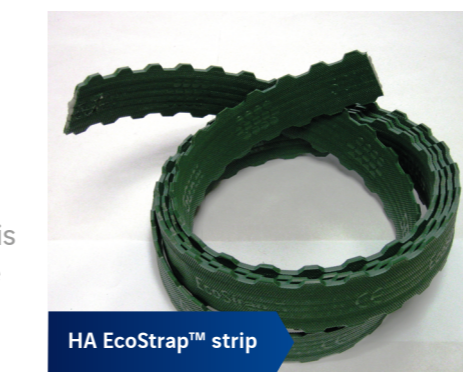
HA EcoStrap™ strip