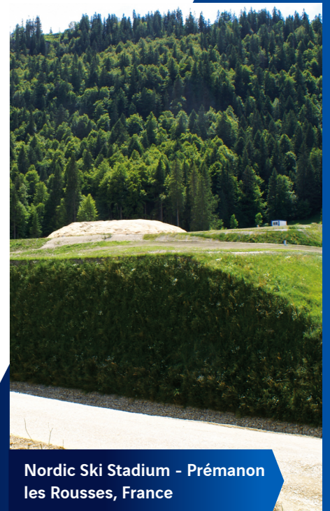
Nordic Ski Stadium - Prémamanon les Rousses, France