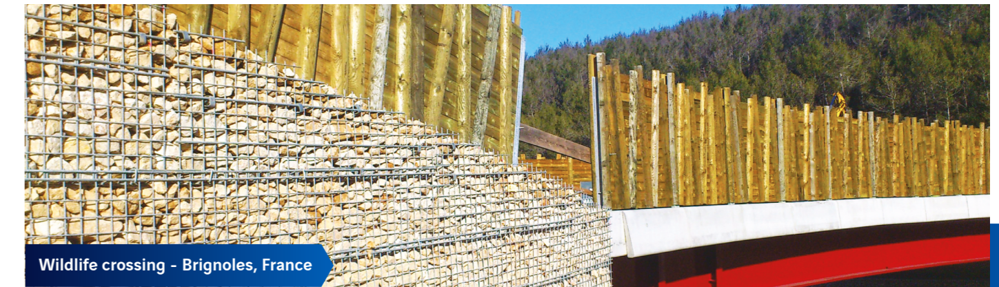
Wildlife crossing - Brignoles, France

Due to the modularity of the GeoTrel™ system and portability of its components, this solution is readily adapted to remote areas.