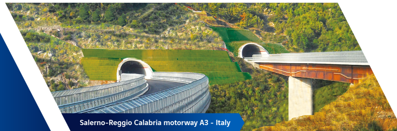
Salerno-Reggio Calabria motorway A3 - Italy