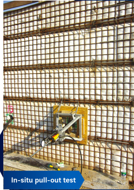
In-situ pull-out test

The GeoTrel™ system is one of the most cost-effective solutions for reinforced soil structures.