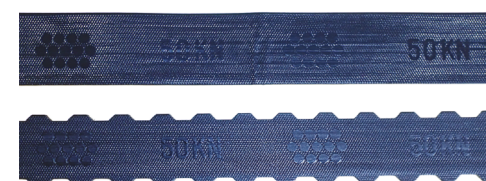
GeoStrap® reinforcing strip

As with all Reinforced Earth® structures, the GeoTrel™ system is designed according to the governing international standard for its location.