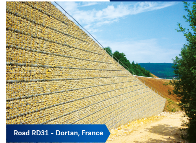
Road RD31 - Dortan, France