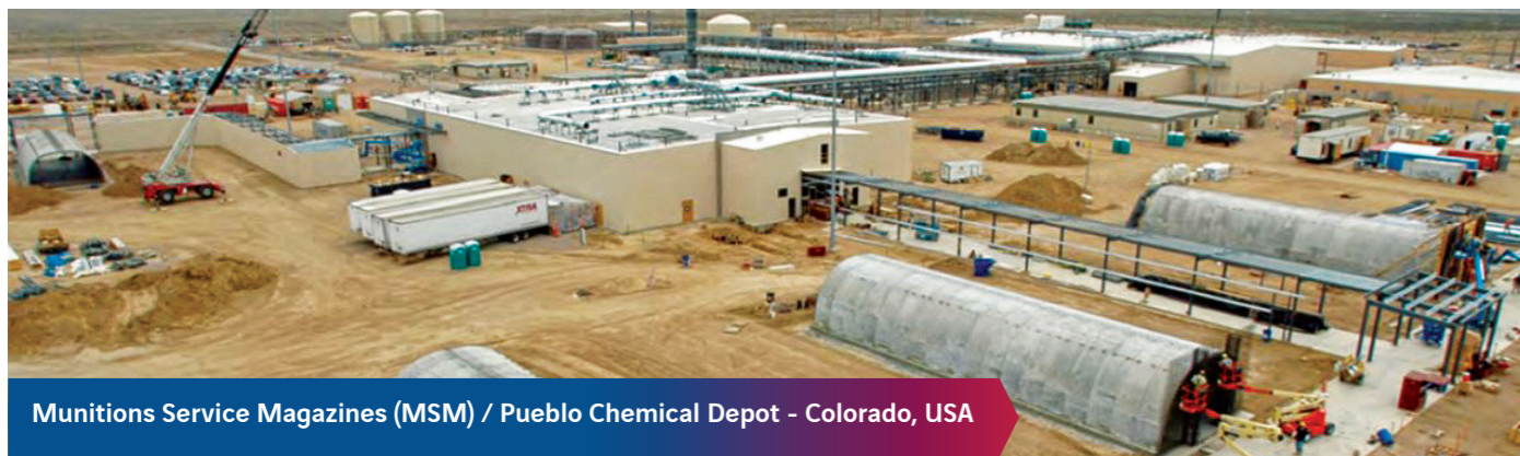
Munitions Service Magazines (MSM) / Pueblo Chemical Depot - Colorado, USA

Engineering expertise, innovation and excellence in client care to deliver sustainable solutions.