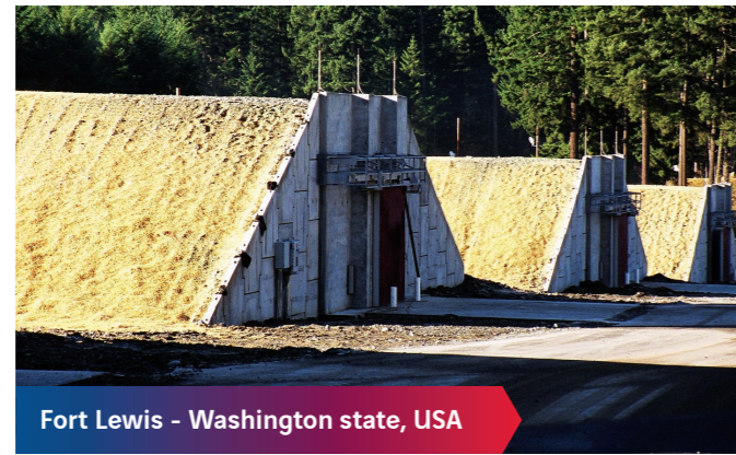
Fort Lewis - Washington state, USA