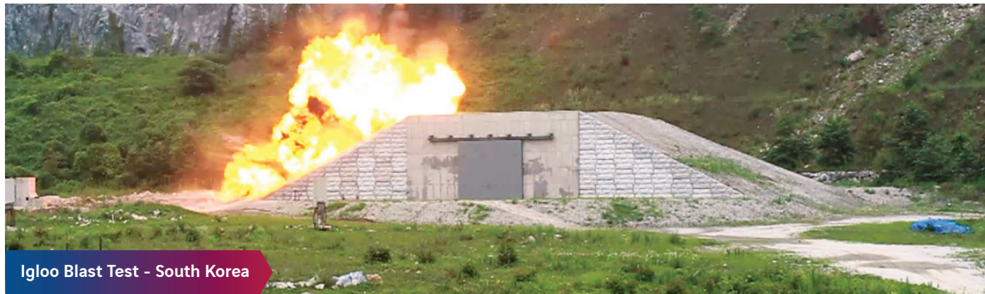
Igloo Blast Test - South Korea