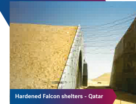
Hardened Falcon shelters - Qatar

Reinforced Earth® ammunition storage facilities and explosives magazines have been built worldwide. Our structures are fully tested and proven in a series of full-scale explosion and blast tests. They comply with the highest standards.