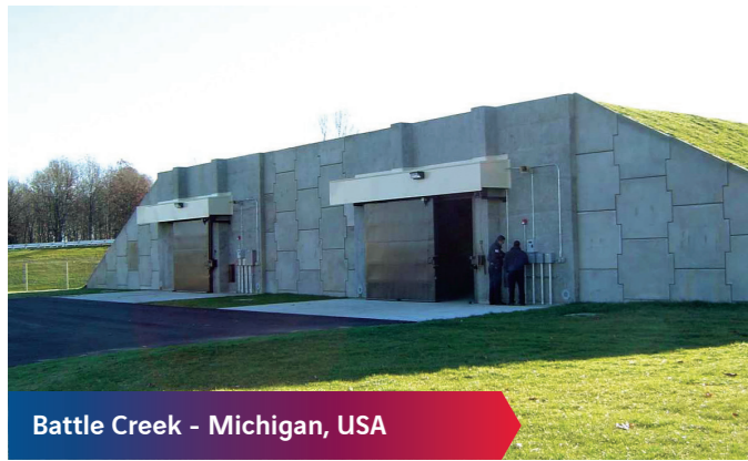
Battle Creek - Michigan, USA