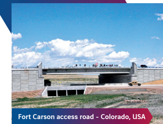
Fort Carson access road - Colorado, USA

Reinforced Earth® structures have become one of the standards for supporting roads, with tens of thousands of structures meeting the requirements and specifications of the world's road authorities. TechSpan® tailored precast concrete arches are a durable system capable of withstanding extreme loads. It can be delivered to remote locations around the world. Reinforced Earth® abutment walls can be designed to accommodate abutment on piles or spread footings. Either systems can be erected in a short window of time with limited or no disruption to traffic flow.