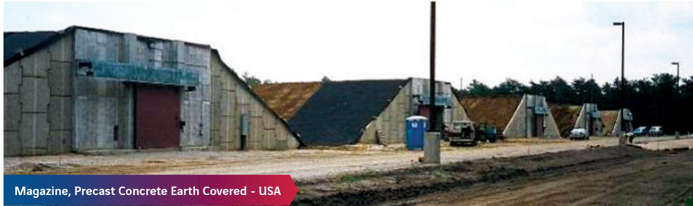
Magazine, Precast Concrete Earth Covered - USA