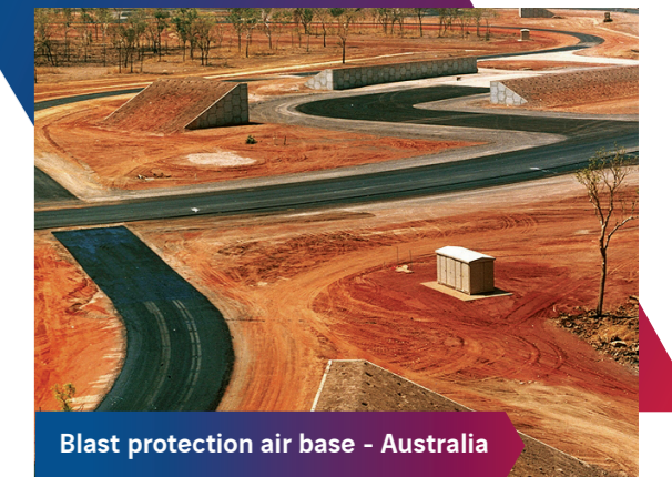
Blast protection air base - Australia

Reinforced Earth® has proven to be a highly stable explosion barrier that impedes the propagation of a blast at ground level and absorbs high levels of energy due to its tolerance for deformation. Moreover, our structures minimize the dispersal of debris during an explosion. Dimensions of the structures can be customized for the asset to be protected.